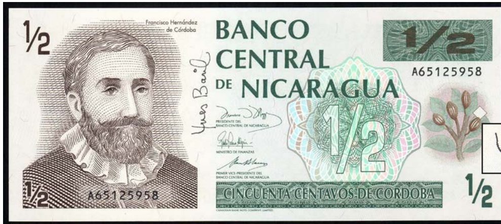
The hand-signed Nicaraguan note that started a new collection.

Most experts consider engravings of people the most difficult to achieve. I admire and appreciate the craftsmanship involved with designing and engraving banknotes. Time was, when you joined a banknote firm as an engraver, you basically became professionally incognito. Security printers did not want any part of their business known to the public. I believe it is worth taking the time to single out these craftsmen and acknowledge their work.